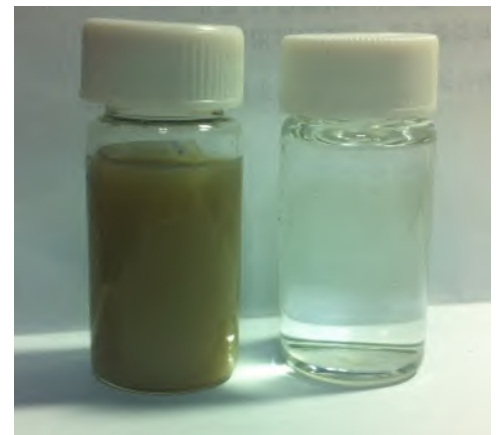
Figure 1 Samrong Tong's (L) and Lvea Aem's (R) samples

The results that returned showed positive on levels of arsenic, which is of course the main concern in these water tests. Biological activity was high however expected. Turbidity and solids suspension were significant despite the clarity of the filtered water.